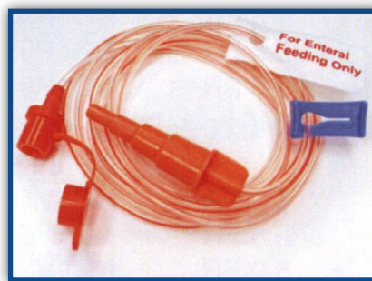
Enteral extension sets