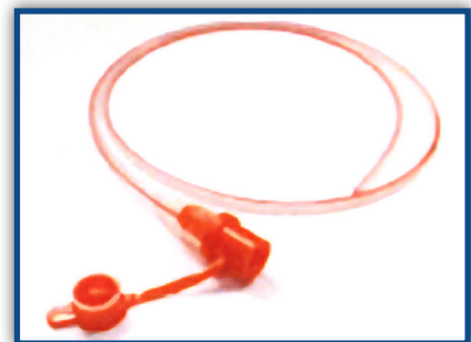
Polyurethane, PVC and Silicone feeding tubes