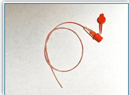
Enteral Feeding Tubes Polyurethane and Silicone